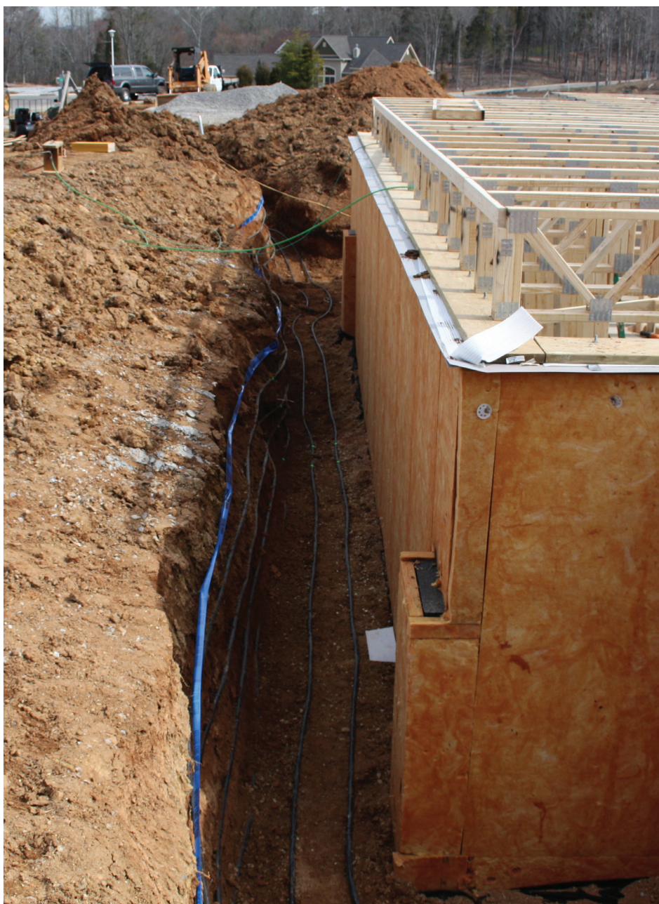
About 100 feet of the six-pipe heat exchange loop was placed along the basement and the remaining loop was placed in utility or additional trenches.

House one and two both used the horizontal loop installation method with three-fourths-inch pipe, house one using 1,800-foot of pipe and house two using 2,610-foot of pipe. The loop fluid was 20 percent propylene glycol